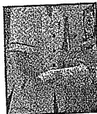
Accidents can lead to compensation.